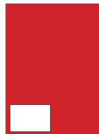
1/8 page - 3.375" x 2.25"